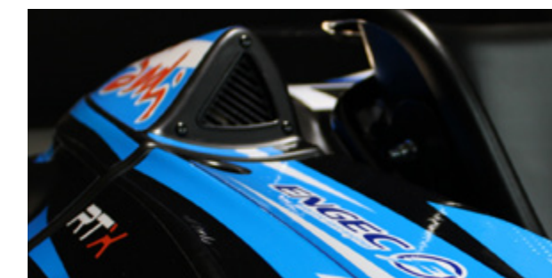
ENGEC electrical technology specially developed for kart racing

PROSLIDE ABSORBER SYSTEM H.E.A.D. system