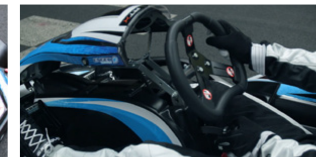
100% Adjustable driving position