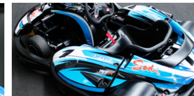
Exclusive symmetrical design chassis for easy and precise driving